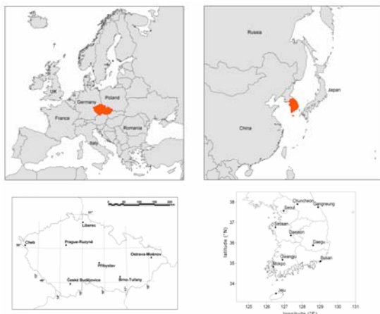
Figure 1. Areas under study and locations of meteorological stations.

‘oppressive’ weather conditions, namely development of methods by which it is determined whether a day will be oppressive, and a subsequent implementation of heat-watch-warning systems that take action when an oppressive day is forecasted, have decreased the numbers of victims due to heat stress in many mid-latitudinal locations (e.g. Kalkstein et al. 1996a, Ebi et al. 2004).