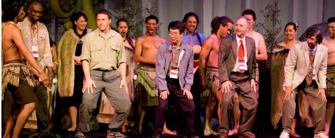
Keen performers of the Haka during the Gala Dinner night

MODSIM07 attracted over 470 delegates from 26 countries, who descended on Christchurch in December 2007 to experience MODSIM the kiwi way!