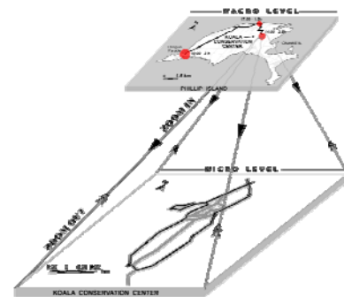
Figure 3 Spatial zooming of tourist movements between the macro and micro scale

Geographic entities can be perceived and examined in not only different levels of spatial resolution but also different levels of temporal detail. The changes in geographic entities are usually modelled in multiple steps (discrete timestamps or instances). Each step is represented as one state or 'view'. The degree of detail included in each view is dependent on the level of temporal resolution, defined in seconds, minutes, hours, days, weeks, or years. Zooming these temporal granularities alter the level of detail of information included in the model. A coarser-grained view of an object over time incorporates less detailed information or greater level of 'abstraction'. While a finer-grained view of an object over time is more detailed or 'articulated'. Transition from abstraction to articulation is an expanding process, whereas the shift from articulation to abstraction is a compressing process. These shifts among the different levels of temporal resolution of objects are referred to as temporal zooming (Hornsby 2001; Hornsby & Egenhofer 1999).