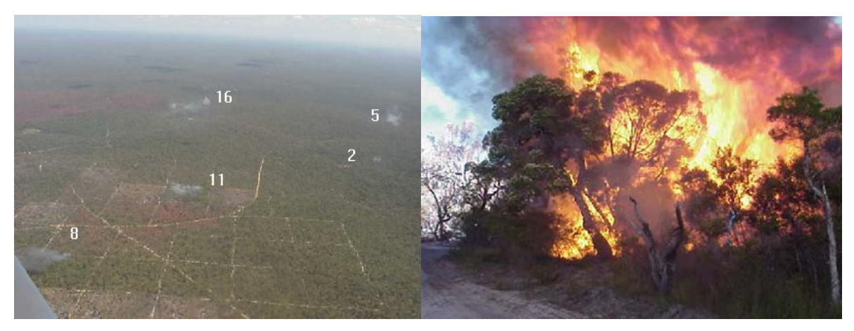
Figure 2. Left: Simultaneous ignition of multiple plots during Project Vesta. Numbers indicate surface fuel age (years since fire). Right: High intensity fire during Project Vesta.

kW/m, respectively. The main outcomes of this project were the evaluation of prior fire spread models performance (McCaw et al. 2008) and the development of a fuel hazard assessment guide and an operational fire behaviour prediction model for dry eucalypt forest (Gould et al. 2007).