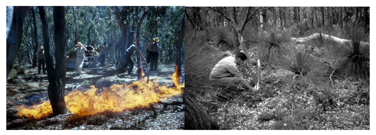
Figure1. Point source ignition of experimental fires, (a) left: ACT, 1960s, (b) right: Dwellingup, WA, 1959.

1991). At about the same time G.B. Peet in Western Australia carried out similar fire behaviour experiments (Fig 1.b) that lead to the development of the Forest Fire Behaviour Tables (Peet 1965, Sneeuwjagt and Peet 1985), a prescribed burning guide. Not much detail exists on the dataset characteristics of these pioneering experimental burning programs. Nonetheless, it is understood that a large proportion of the datasets correspond to relatively small and low intensity burns. Understanding the limitations of these datasets and the fuel type specificity that arises from models derived from them, two major burning programs were conducted by CSIRO Forestry and Forest Products Division in the 1980s and 1990s in grasslands and dry sclerophyll forest with the aim to establish causal relationships between fuel, fire weather variables and fire behaviour quantities.