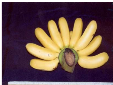
Figure 1. Banana (Kasetsart 2)

Abstract: Crop modelling in Thailand presents challenges to both farmers and researchers. Farmers want to increase production, reduce costs, and remain profitable under variable climate and economic conditions. Researchers want to match soils, climates, and crop growth and give sound management advice. PLANTGRO - a generic system for predicting growth of plants was used to predict the performance of a new variety of banana (Kasetsart 2) grown in four different environments in Thailand.