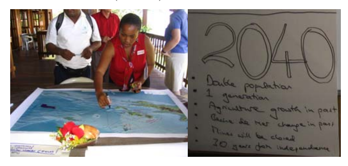
Figure 2. (Left) Participants illustrated places they considered to have ecotourism significance on a map of Milne Bay Province. (Right) 2040 was identified as the timeline on which to explore future scenarios, based on participants' knowledge of past events and on future projections.

The group then identified drivers that might influence the outcome of the guiding question (Table 1). Each participant was asked to write down the three drivers that they believed would be most influential for achieving sustainable ecotourism to 2040. Participants felt it was necessary to specify positive and negative drivers, and it was agreed that each person would write down three of each type. These were displayed for the group, and from these, participants selected drivers that they felt would have the highest impact and were most uncertain (Table 2).