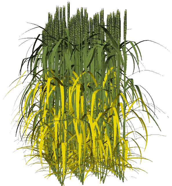
Figure 1. Simulated stand consisting of 4 rows of 15 wheat plants each, created using the FSPM methodology. Reprinted from Evers et al. (2011) with permission from Elsevier.

In combination with dedicated experiments, this modelling tool can be used to analyse the response of plants to (imminent) competition, simulate the competitive advantage of shade avoidance for plants of different architecture, and predict plant form in various light environments. To assess the effect of plant population density through R:FR signalling on tillering (branching) in spring wheat ( Triticum aestivum L.), an FSPM study was conducted (Figure 1). A simple descriptive relationship was used to link R:FR as perceived by the plant to extension growth of tiller buds and probability of a bud to form a tiller. A further study included a complete sub-model of branching regulation, aiming at simulating branching as an emergent property in Arabidopsis thaliana under the influence of R:FR. These and other studies show that FSPM is a promising tool to simulate aspects of plant development, such as branching, under the influence of environmental factors. In close combination with dedicated experiments, FSPM can shape our ideas of the mechanisms controlling plant development, can integrate existing knowledge on plant development, and can predict plant development in untested conditions.