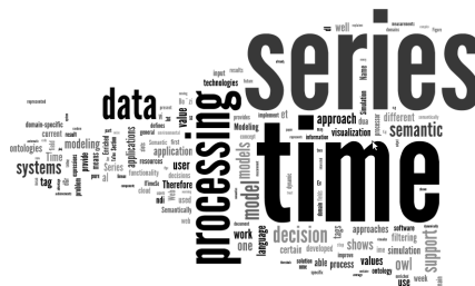
Figure 2: A tag cloud of this document generated with Wordle.

Figure 2 shows a tag cloud generated by Wordle 3 . It corresponds to our visualization functionality and shows a tag cloud generated out of terms. The size of a word demonstrates the frequency of the appearance of the word