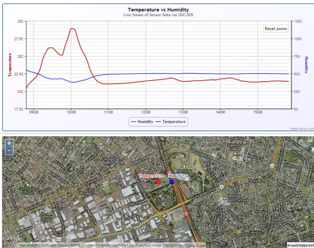
Figure 3: Illustration of a real-time streaming of Temperature and Humidity data using the proposed OGC-SOS

A web application was developed to enable monitoring and visualization of climate, atmosphere, plants and soil data from each vineyard. The server side processes the incoming data and populates the database. Figure 3 depicts real-time streaming of temperature and humidity using the proposed OGC-SOS described in Section 4.