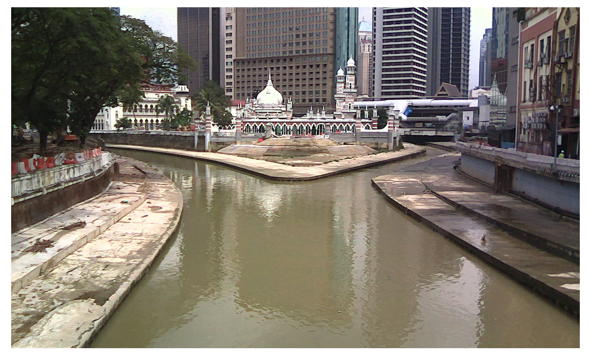
Figure 1. Confluence of the Sg Klang (right) and the Sg Gombok (left); the Sultan Abdul Samad Jamek Mosque is in the background. Tun Perak Bridge can be seen towards the top right.

Kuala Lumpur, the capital city of Malaysia, is a major metropolitan city in South East Asia. It is situated in the valley of the Klang River (Sungai Klang: Sungai is the Malay word for River and is abbreviated as Sg), where many tributaries converge. The city's name (Malay for 'muddy confluence') comes from the confluence of the Sg Klang and the Sg Gombok (Figure 1), the location of the city's centre.