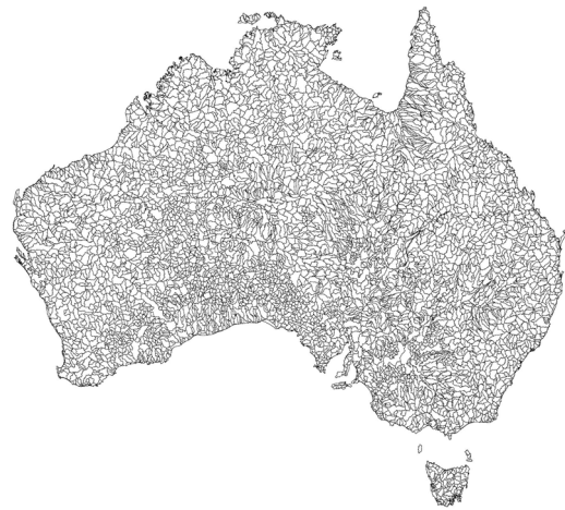
Figure 1. Catchment delineations for Australia.

The land surface model used in this study is the catchment-based land surface model (CLSM) of Koster et al. (2000). The key innovations of this model are the explicit inclusion of sub-catchment spatial variability and the model domain, which is