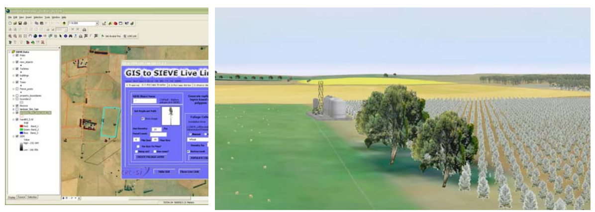
Figure 3. The linkage between candidate decision polygons in the GIS (left) and the SIEVE expression of chosen land uses (right). The chosen polygon has been filled with a bluegum plantation.

The key difference between the two farms in terms of land use was that the better managed farm had replaced annual pasture with a deeper rooted and more heat resilient perennial grass species. This allowed for productive and persistent grass in dryer conditions and at the same time higher sheep stock rates. The farm that did not adapt their management to climate change had poor grass growth and low stocking. Similarly, the wheat paddocks on the better managed farm used a better wheat variety and were more productive.