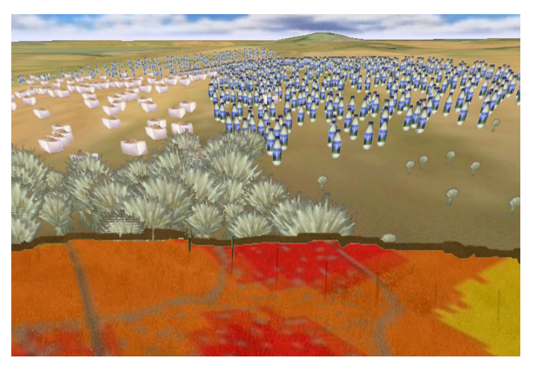
Figure 4. In this case the landscape has been cut away to show the water table under a specific land management scenario. On the land surface the productivity outcomes are illustrated using icons (e.g., wheat sheaves and milk bottles) whose size and density represent outputs and efficiency levels respectively.