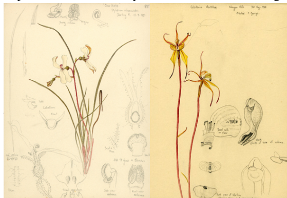
Figure 2. An example of a previous untapped source of phenological data. The diaries and art work of Rica Erickson (1908- ) provide information on the location, date and phenological phase of many native Australian plants.

An example of a system designed to document existing long-term datasets is the National Ecological Meta Database ( http://www.bom.gov.au/nemd/ ). Held by the Bureau of Meteorology, this database encourages users to list long-term ecological data, such as flowering, budding, fruiting, migration and breeding dates. The site can also be used to search for existing datasets. This project relies of people's willingness to share information about their datasets.