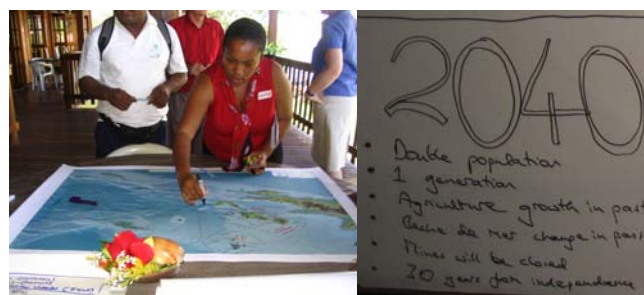
Figure 2. (Left) Participants illustrated places they considered to have ecotourism significance on a map of Milne Bay Province. (Right) 2040 was identified as the timeline on which to explore future scenarios, based on participants’ knowledge of past events and on future projections.

The group then identified drivers that might influence the outcome of the guiding question (Table 1). Each participant was asked to write down the three drivers that they believed would be most influential for achieving sustainable ecotourism to 2040. Participants felt it was necessary to specify positive and negative drivers, and it was agreed that each person would write down three of each type. These were displayed for the group, and from these, participants selected drivers that they felt would have the highest impact and were most uncertain (Table 2).